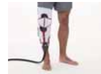
Articulated Knee Wrap